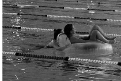
Seventy five girls were either in the DSG pool or on a flotation device throughout the day to help Holy Cross School

Girls were asked to donate R150 each to swim for a period of time in the school’s indoor pool. The ‘swimathon’ began at the very early hour of 5am when some sleepy yet tenacious girls dived into the pool and began their laps. The Interact girls decided upon the criteria which appeared to be that one needed to be in the pool or poised on a floating device. Approximately seventy five girls involved themselves ranging from all ages. The senior girls were stoical and determined in their support of the event especially in the colder, earlier hours of the morning. As the day progressed the fun increased and a happy day was enjoyed by all the girls who participated. It provided the opportunity for team swimmers to swim alongside girls with little pool confidence giving everyone a delightful time.