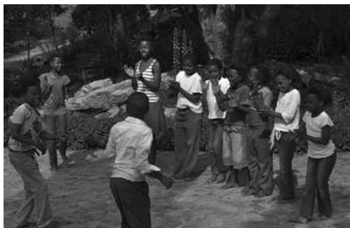
At the After-School Programme Farewell, the children performed plays, music and dancing to an audience of the teachers, the monks and distinguished guests.

created to explore and receive support around past experiences, as well as learning healthy coping skills for the present and future. Follow up sessions will be arranged during the next school break. Psychotherapy was, and will continue to be an option offered for any who could benefit from it. A similar programme will be planned for the boys in the near future.