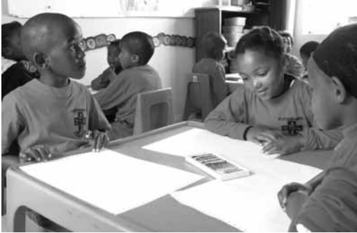
Holy Cross School Year Two Class

There was much scurrying in early January to get the little house we use for Holy Cross School ready to begin our second year of teaching. We increased the size of the school by one bringing the total enrolment to thirteen. With the afterschool no longer sharing the